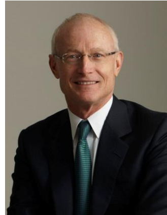
Michael Porter is the Bishop William Lawrence University Professor at the Harvard Business School. He is a leading authority on competitive strategy, the competitiveness and economic development of nations, states, and regions, and the application of competitive principles to social problems such as health care, the environment, and corporate responsibility. Dr. Porter is the author of 18 books and over 125 articles and has served as a counselor on strategy to the governments of many nations, to leading international corporations, and to nonprofit community organizations. He holds a Ph.D. in Business Economics from Harvard University.

The vision of the MOC Affiliate Network was to create local capacity to understand, teach, and upgrade competitiveness through a highly scalable structure: The Institute for Strategy and Competitiveness (ISC) at Harvard Business School (HBS) developed the curriculum, teaching materials, and a platform for disseminating these materials around the world. The network enables