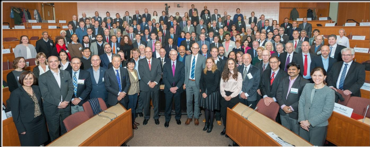
Microeconomics of Competitiveness Faculty Workshop December 8 - 9, 2016

The Microeconomics of Competitiveness course not only builds a cadre of young people trained in the new competitiveness thinking, but also serves as a platform for other efforts by universities to contribute to regional and national economic development. Since the launch of the MOC Affiliate Network in 2002 the number of institutions has jumped from two universities to over 100. In 2016 there were 109 institutions teaching the MOC course around the world (see Appendix I for a full list of participating institutions). The number of institutions and their collective impact will only continue to expand with the growth of the network. Professor Michael Porter and the Institute for Strategy and Competitiveness are committed to strengthening the MOC Affiliate Network, expanding the collective impact on competitiveness by the network affiliates, and supporting the growth of research and teaching of the MOC curriculum around the world.